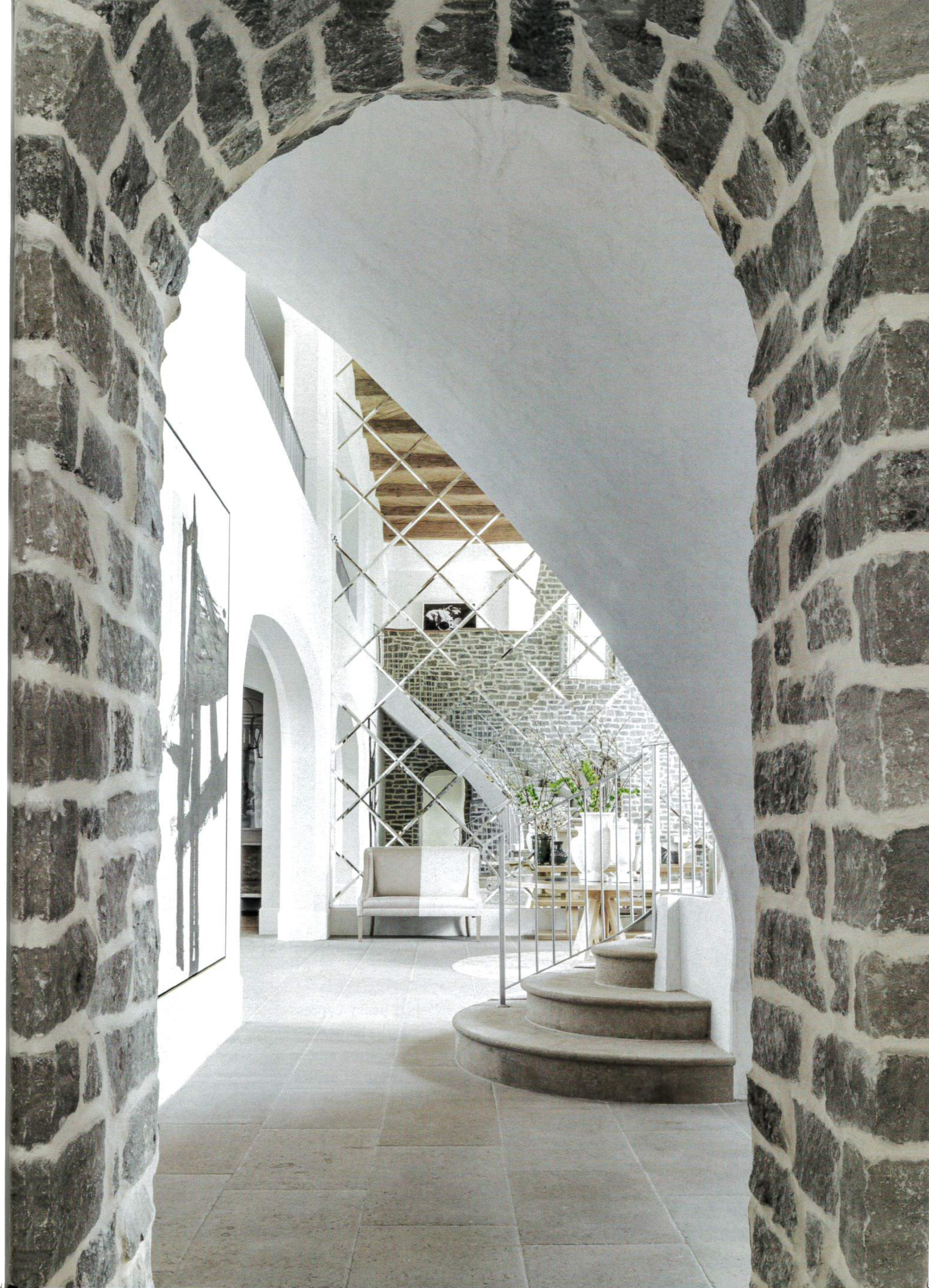
RIGHT: A wall of mirrors reflects the stairway's bullnose stone treads and Julius Blum hand-forged railing. A loveseat offers a place to relax in the foyer's receiving area, while imported Grey Barr French limestone eases the transition into the main living areas.

THE EXCLUSIVE RURAL ENCLAVE of Southwest Ranches has a unique charm that reflects quintessential country elegance mixed with modern sensibilities. The result? An eclectic community characterized by individual flavor—including this 22,100-total-square-foot manse. “Designed by Jeffrey Dungan Architects, the home’s architectural style is based on a rustic French Country theme with many authentic products imported from France,” builder Rick Bell says.