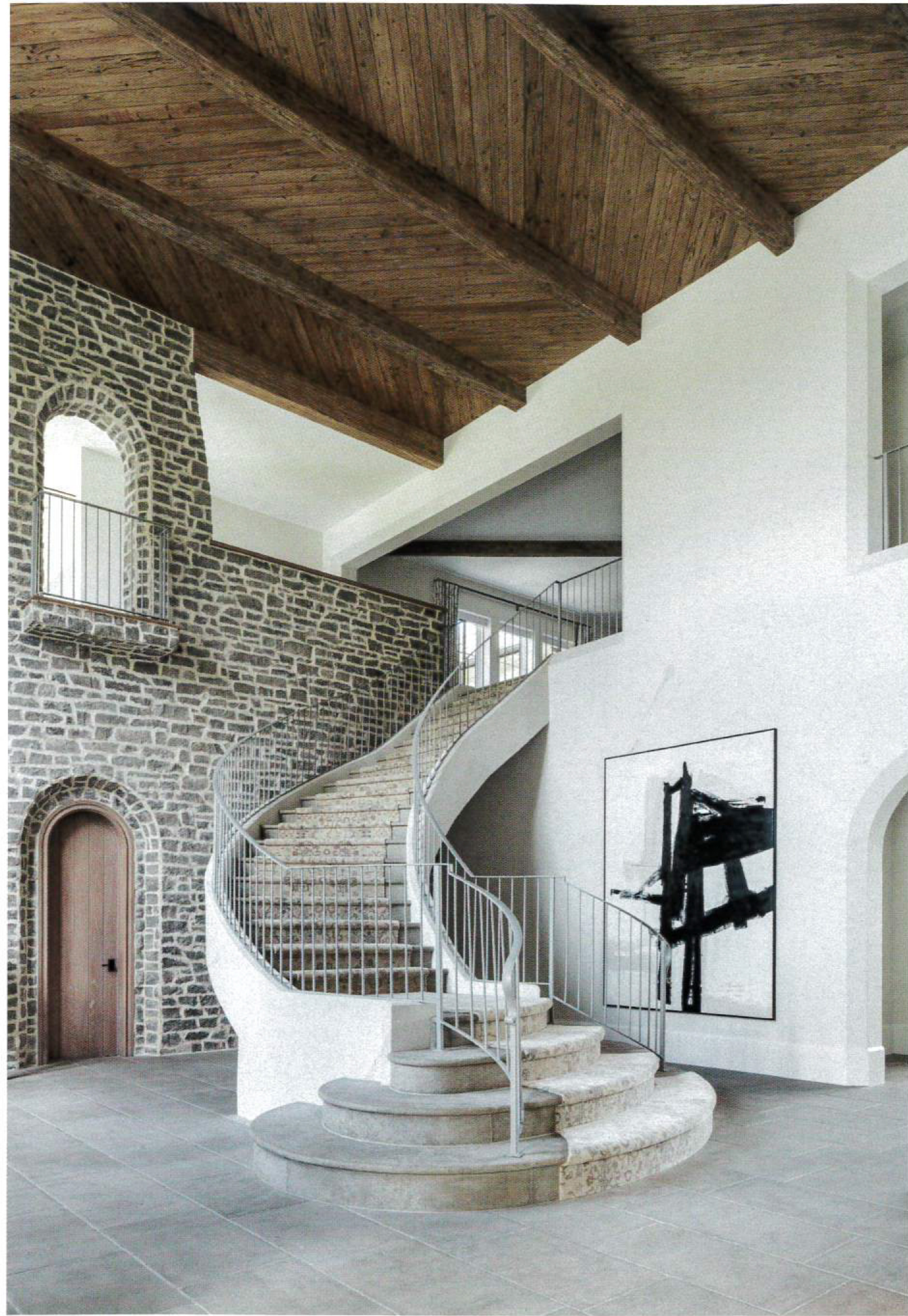
LEFT: The grandeur of the stairway announces entry to the elegant country estate, where a black-and white abstract painting adds a modern complement. A patterned oriental rug by Kravet was custom-colored and installed to follow the stairs' curves. Reclaimed French pine beams span the 24-foot-high ceilings clad in whitewashed pecky cypress in a herringbone pattern.