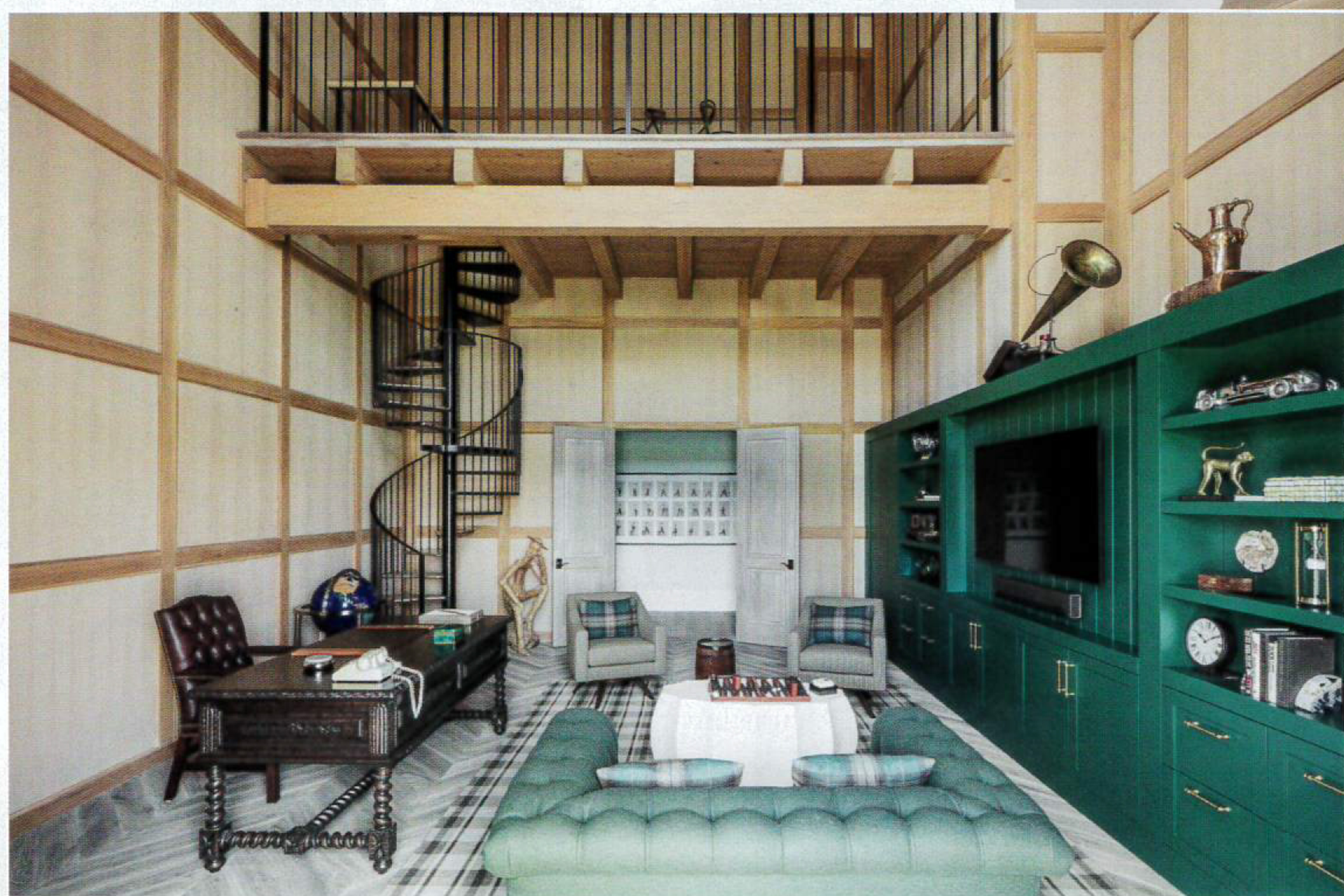
BELOW: The design duo styled the study with the dark tones of an Old Biscayne desk and the tufted oversized desk chair that play off of the Ralph Lauren accent pillows.