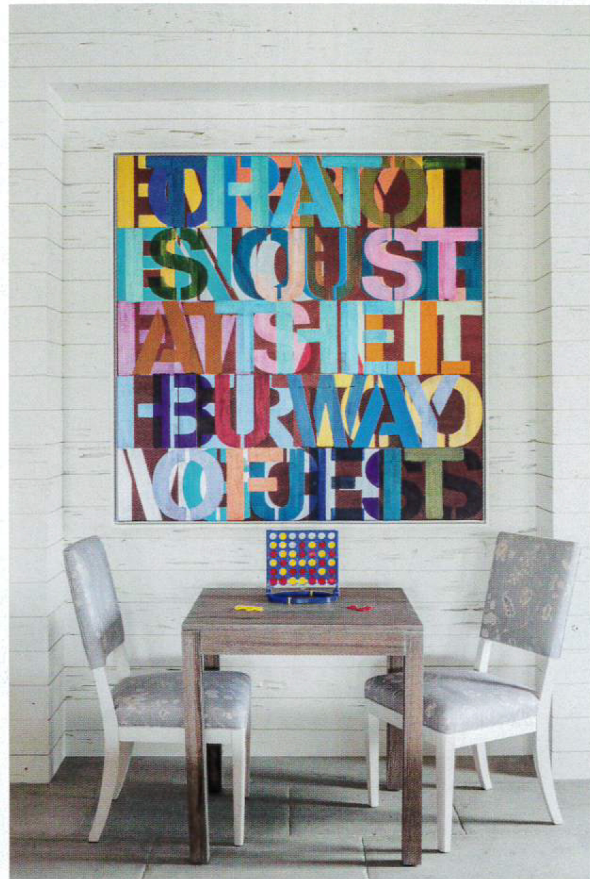
ABOVE: The design team decided to paint the game niche a light grey to break up the home's wood elements.